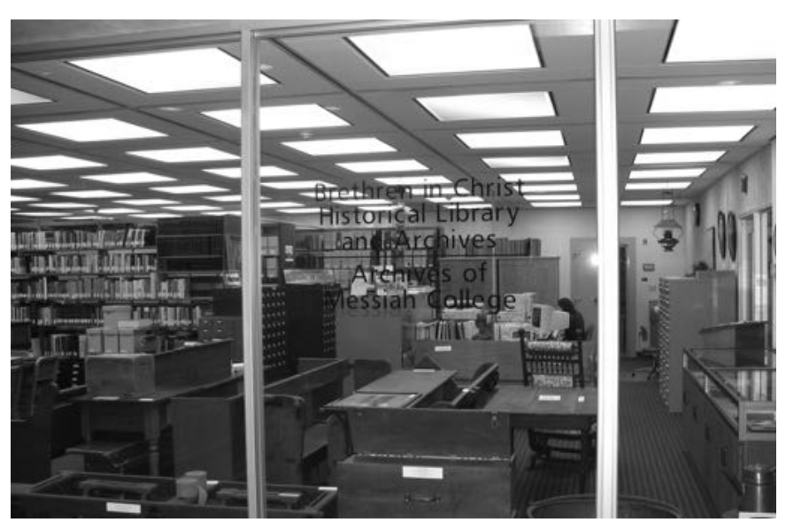
View of the museum area of the Archives.

The Historical Society: The mission of the Brethren in Christ Historical Society is "to nurture understanding and appreciation of the historical, theological, and contemporary life and thought of the Brethren in Christ and related groups." This is accomplished in various ways, such as publishing this newsletter and the journal Brethren in Christ History and Life , commissioning and publishing books, developing new social media